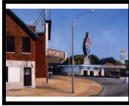
Early Landscape - Photographic Quality

Contributors, Arlene Polangin and August Spector