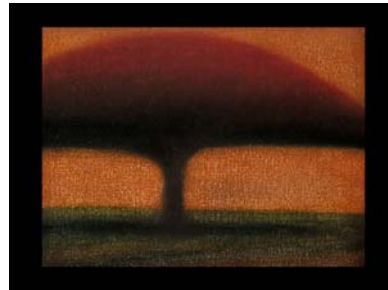
Current Landscape - Abstract Quality