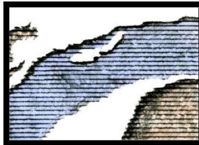
Current -- Cardboard Rubbing